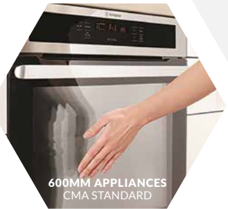
600MM APPLIANCES CMA STANDARD