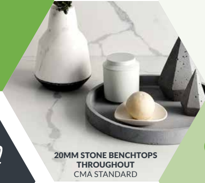
20MM STONE BENCHTOPS THROUGHOUT CMA STANDARD