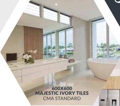
600X600 MAJESTIC IVORY TILES CMA STANDARD