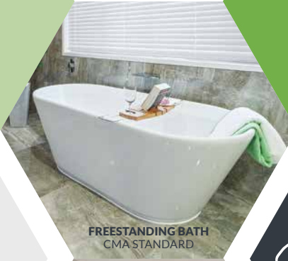
FREESTANDING BATH CMA STANDARD